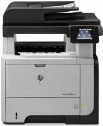
HP LaserJet Pro MFP M521dw

Finish jobs faster, produce high-quality documents, and make scanning and sharing simple. Get set up and connected quickly. 3,8 Send quick commands from an intuitive colour touchscreen. Easily conserve resources and recycle used cartridges. 10